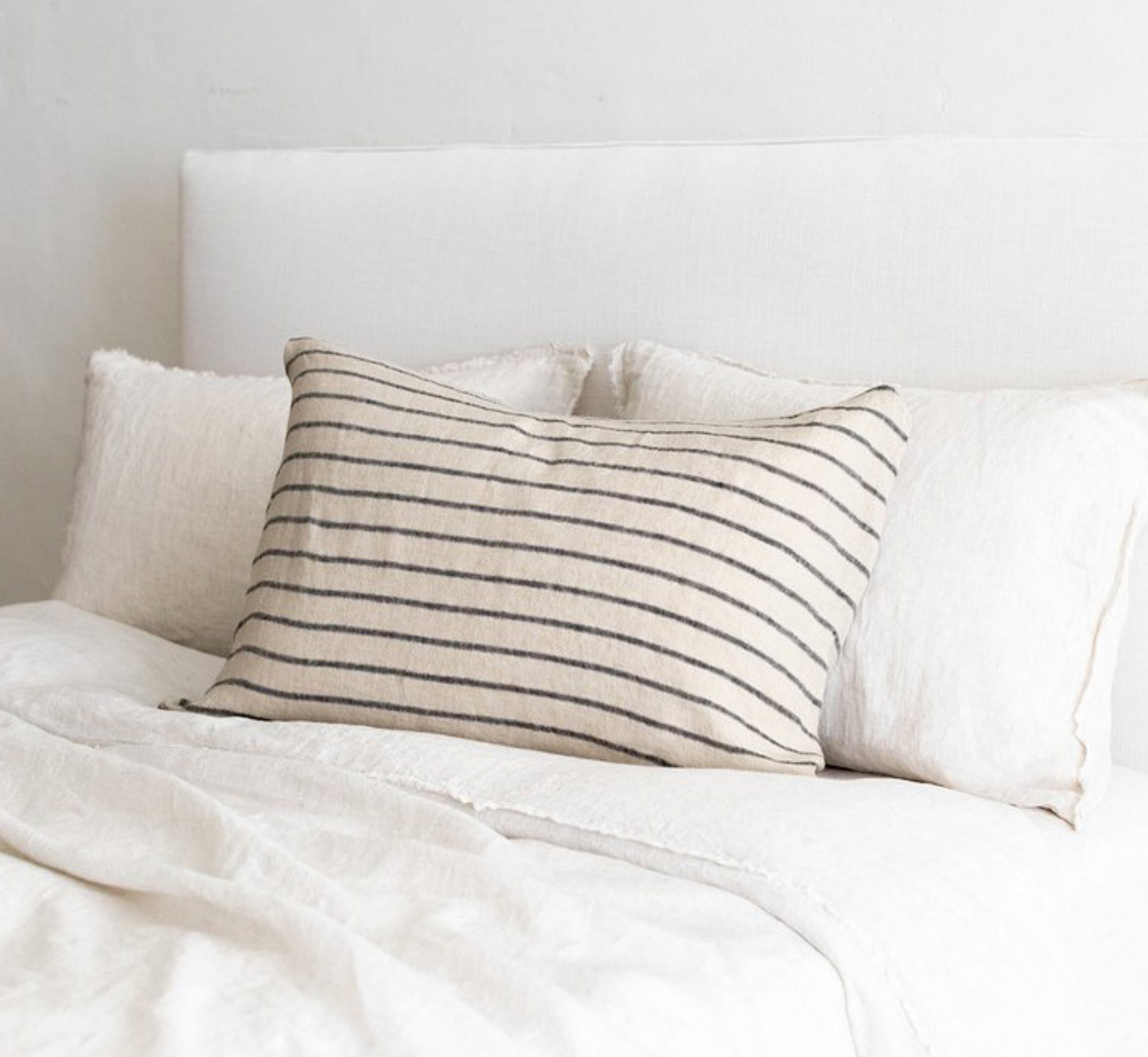
BASIX STRIPE PILLOWCASE @