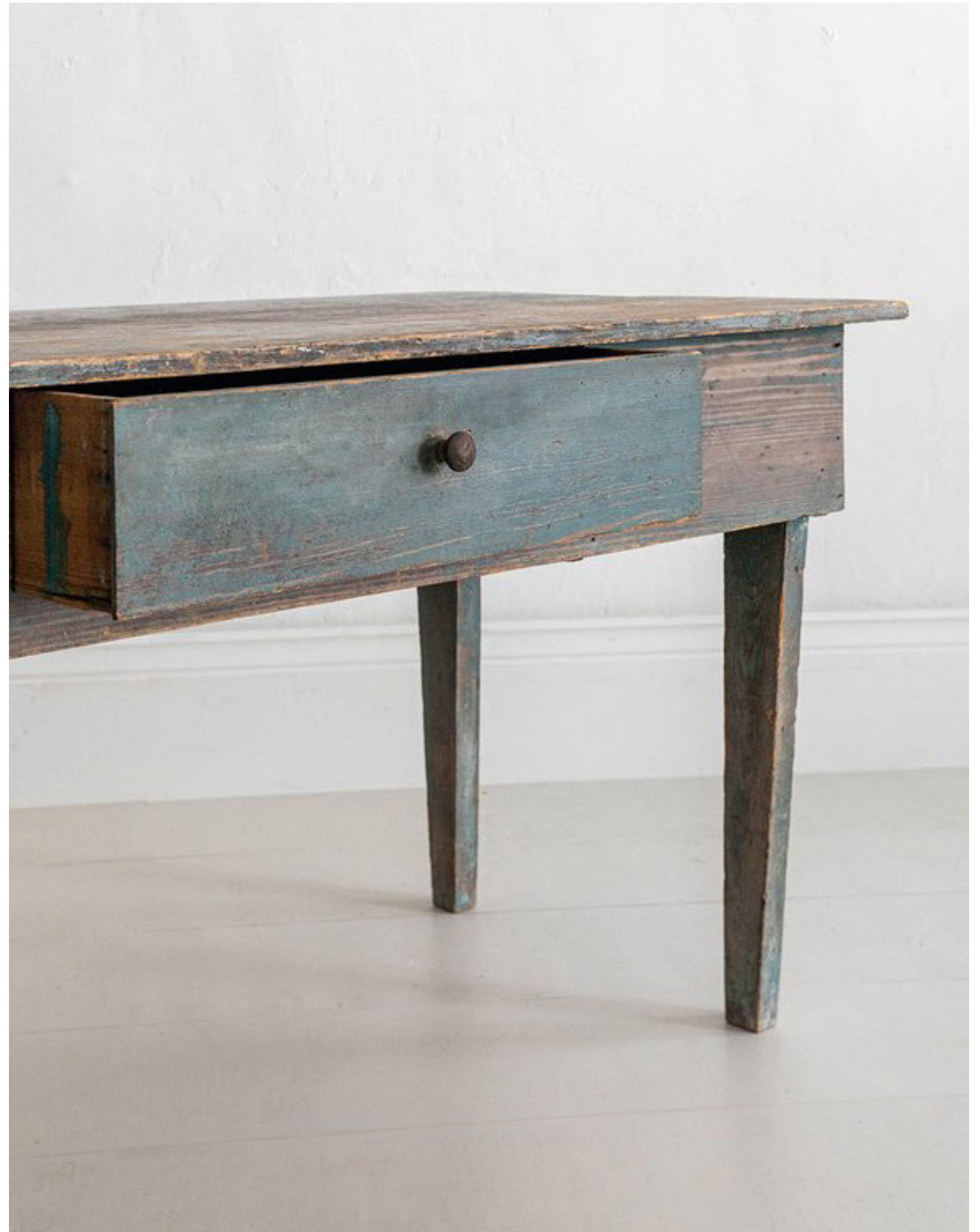
FARM TABLE ©