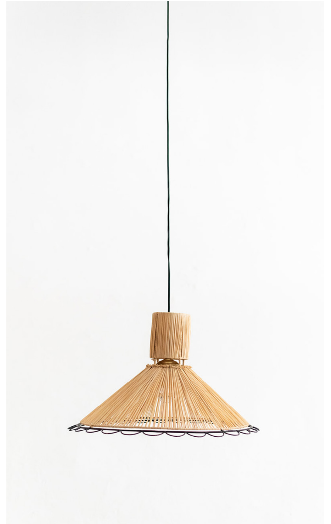
IBIZA PENDANT SHADE ©