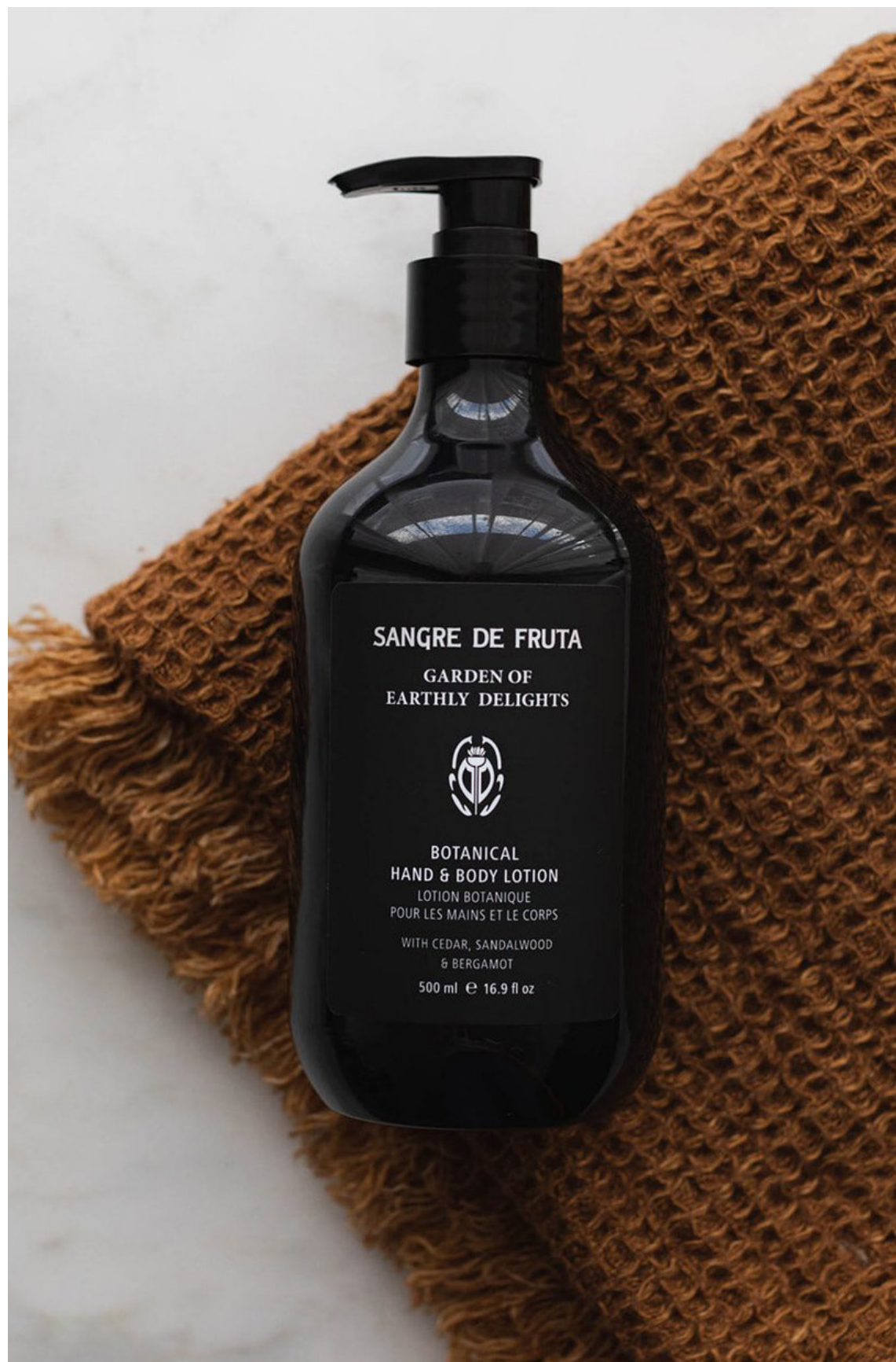
SANGRE DE FRUTA @