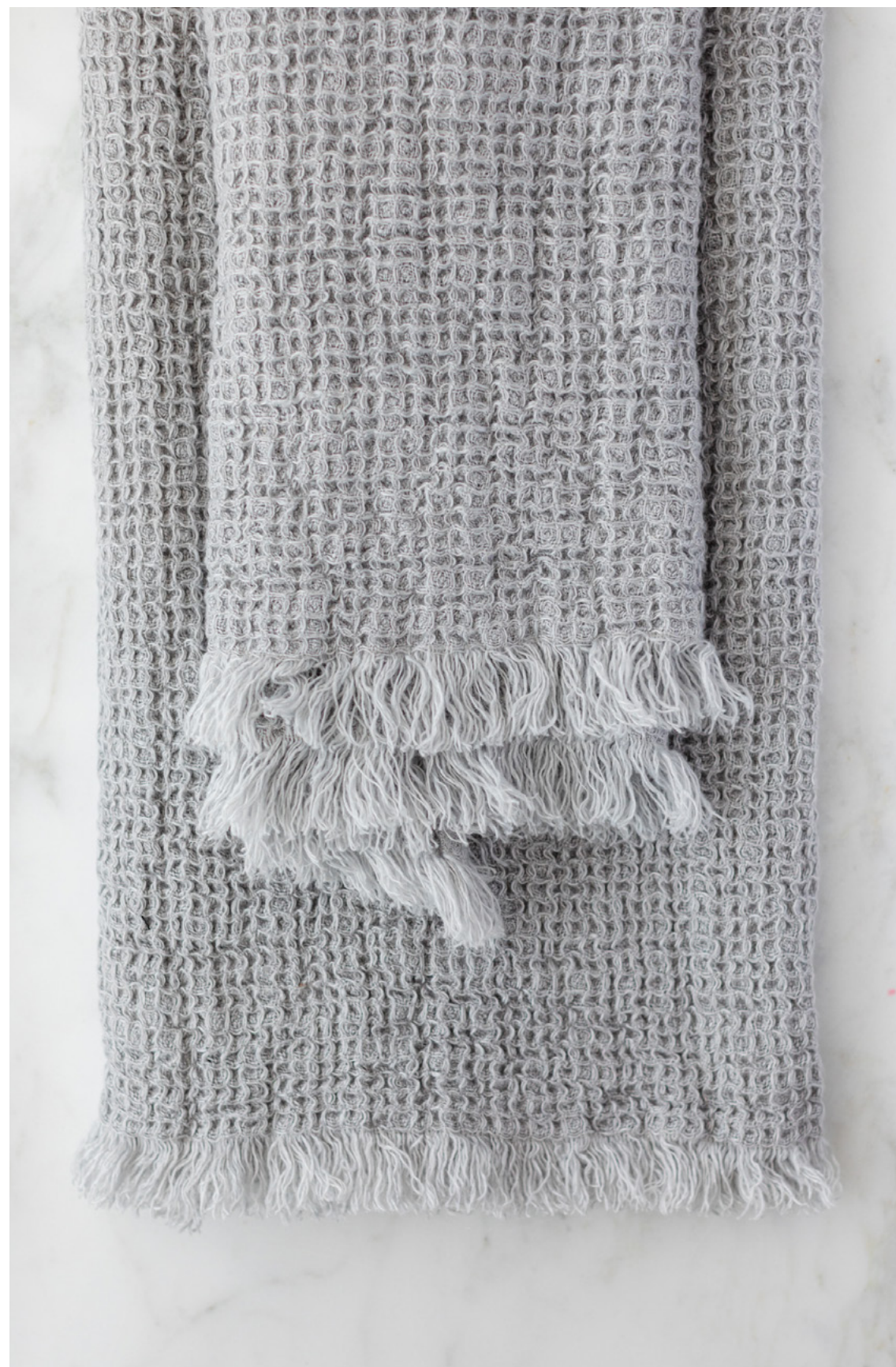
LINEN WAFFLE WEAVE TOWELS @