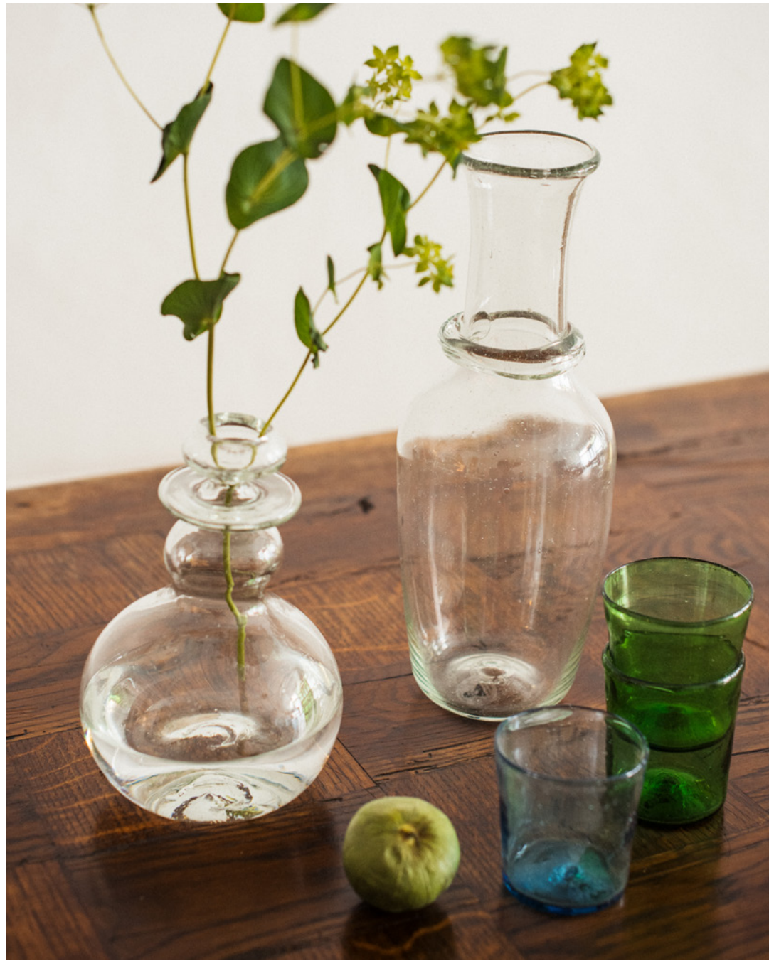
ANJEANETTE CARAFE ©