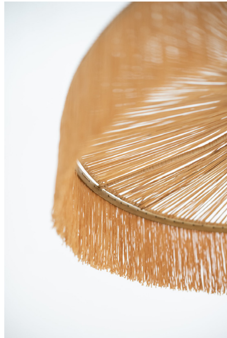
PARASOL PENDANT SHADE ©