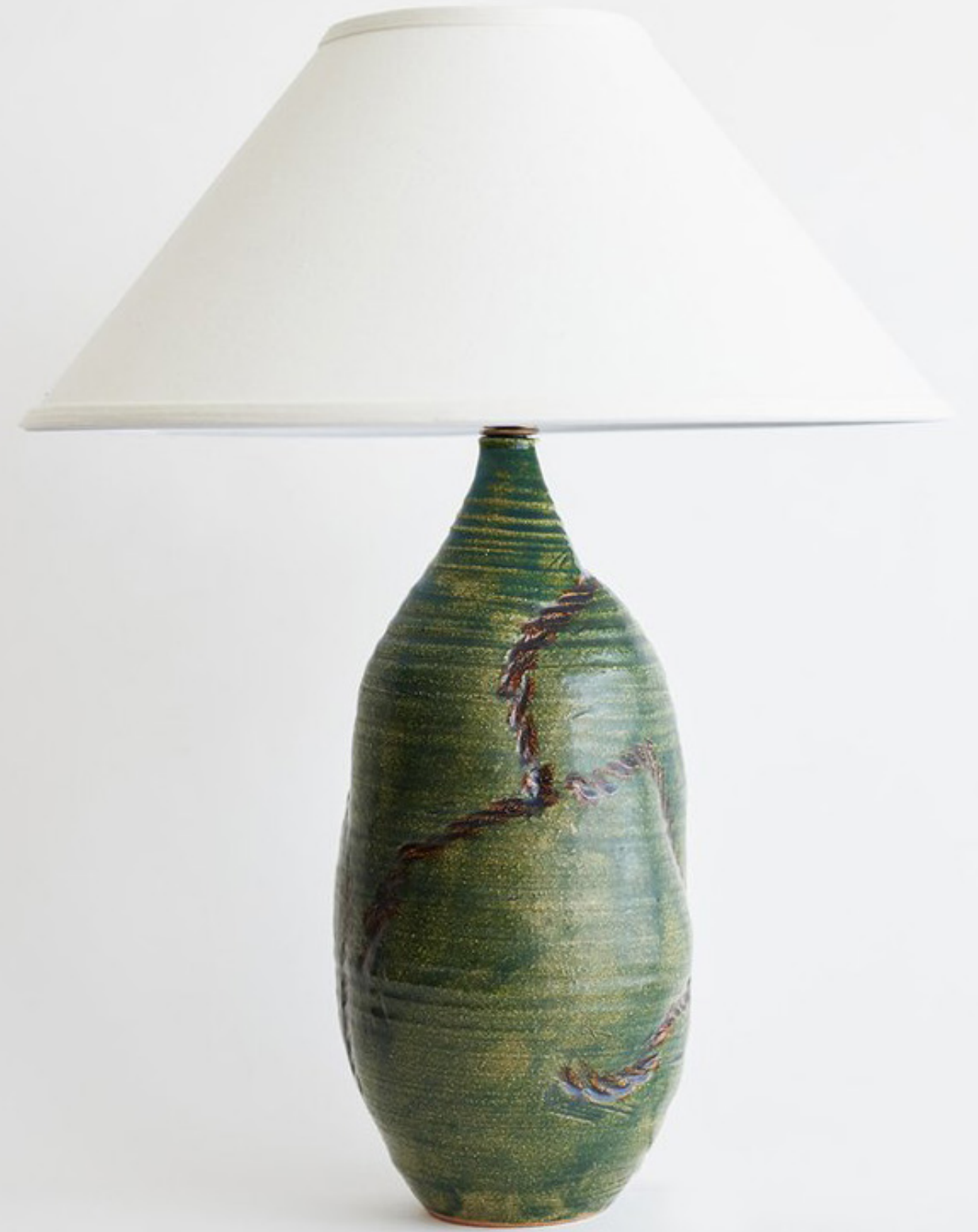
VINTAGE LIGHTING ©