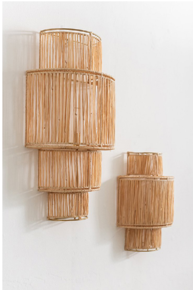
FOUR TIERED WALL SHADE ©

Sunday Shop is one of Honoré's exclusive U.S. retailers with stock available to ship from our New Orleans store.