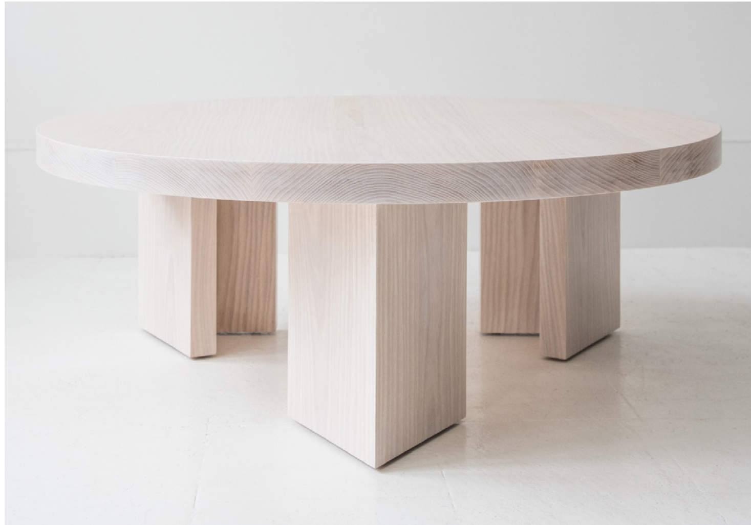
EUCLID COFFEE TABLE

Customizable by size and finish, our collection of made-to-order casegoods, Sunday (work)Shop, make for a timeless addition to the modern home. Each unique in their design, let us help you create the perfect heirloom piece for your next project.