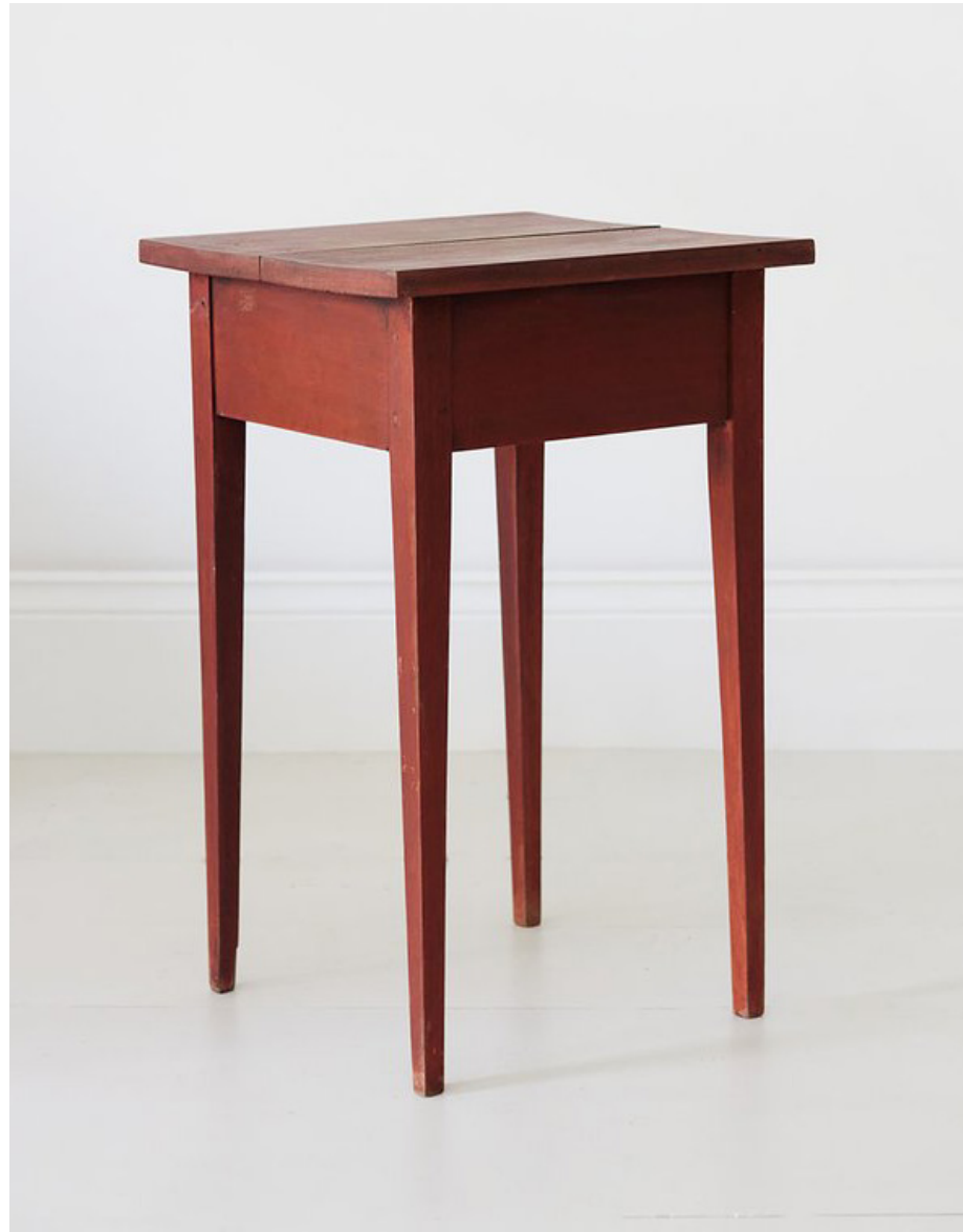
PRIMITIVE SIDE TABLE ©