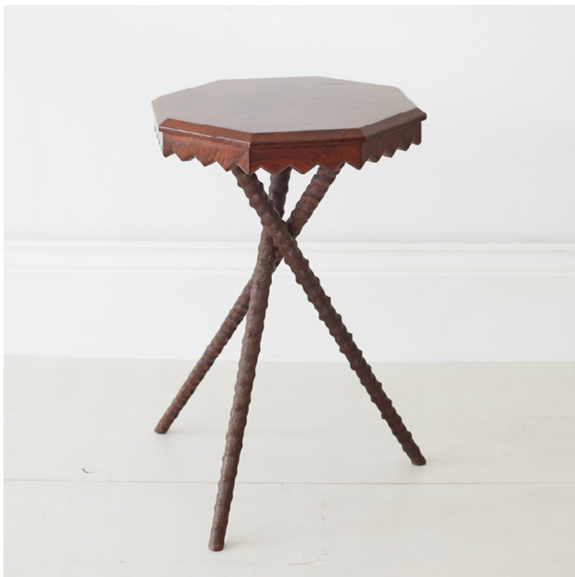
VINTAGE ART TWISTED LEG SIDE TABLE ©